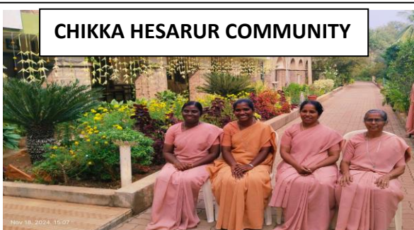
CHIKKA HESARUR COMMUNITY