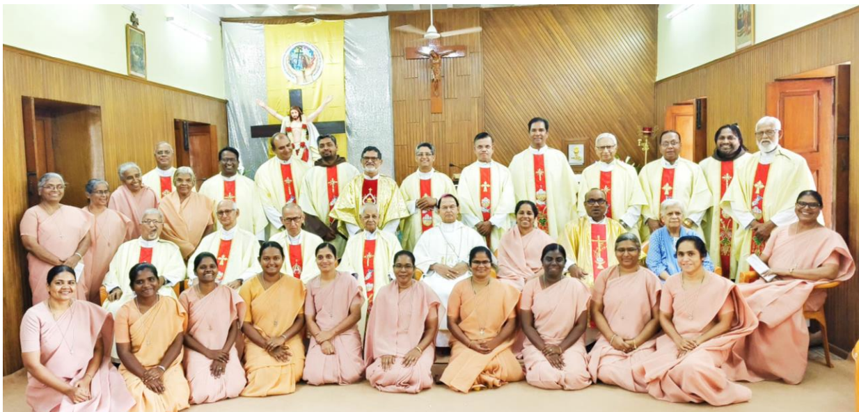
SISTERS OF BELLARY SOCIETY ALONG WITH BISHOP, PROVINCIAL AND CONCELEBRANTS