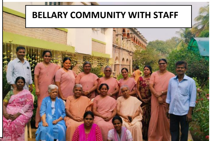
BELLARY COMMUNITY WITH STAFF