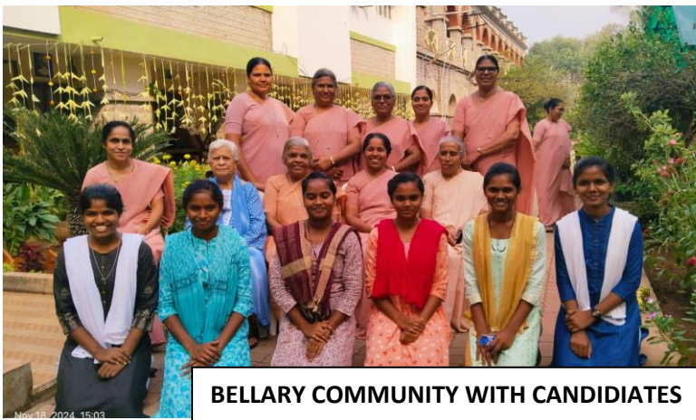
BELLARY COMMUNITY WITH CANDIDATES