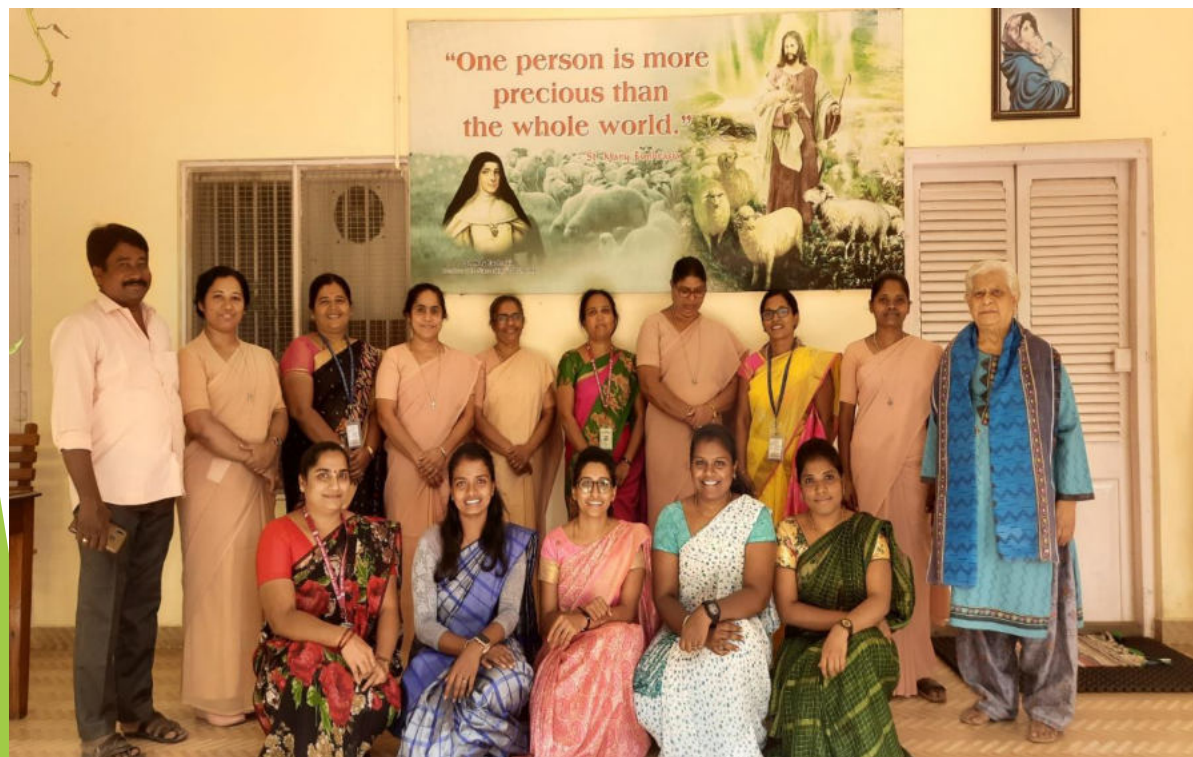
PARTNERS IN MISSION; SISTERS AND LAY