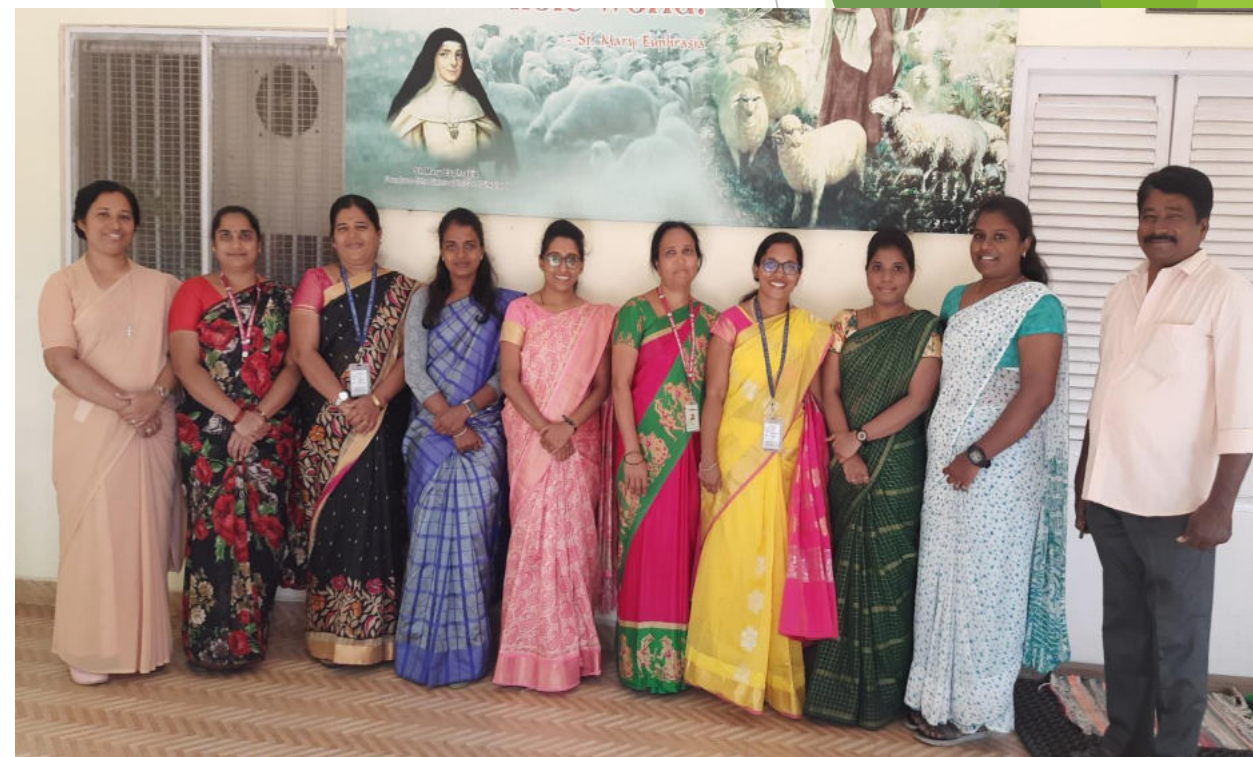
THE MISSION PARTNERS