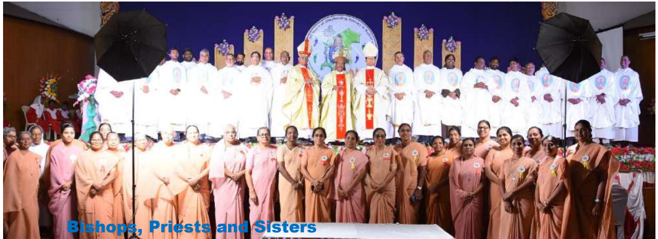
Bishops, Priests and Sisters

Good Shepherd Mission, Bellary — Forever Faithful, Forever Grateful.