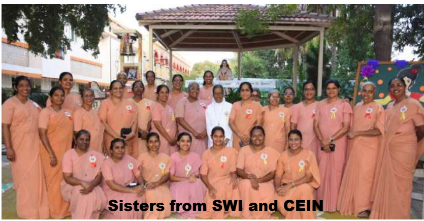
Sisters from SWI and CEIN